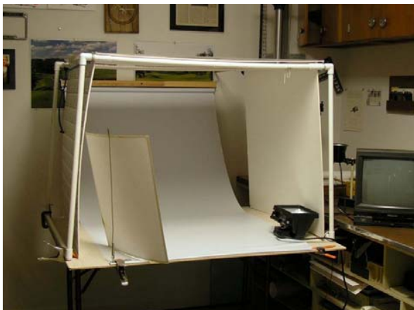
Photo 1. Frame is ½" PVC pipe, sides measure 34"x34" and top is 44" wide. Backdrop is white vinyl roll-up window shade. I often plug the camera video into this monitor for enhanced view of camera image.

The Phrugal Photo Studio way to shoot woodturnings This tutorial is aimed at average "Joe Woodturner" who has some basic photo skills and a digital camera, but not a studio full of lighting equipment. Photographing woodturnings is no more complicated than learning the turning process, but some specialized lighting techniques are necessary in order to accurately present the work. An image of a turning often represents the visual language by which we communicate, and that image must be a literal rendering, with accurate color, dimension, and a sense of reality. In order to convey the message without distraction, keep things simple- we are not selling a "candlelight halo" of a product in a simulated environment. Let's start with the Phrugal Photo Studio principle of maximum image quality with minimum cost and equipment. A box frame made with PVC pipe and sides of foamcore panels provides the means to contain and control light, in this example a regular $10 Q/H 500w work light fixture. The light is aimed up, not directly toward the subject turning, as in photo 1 below.